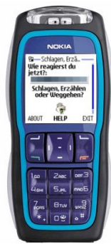
Figure 2: Mobile Phone as Interaction Device

We are currently developing several prototypes. For the first prototype we decided to use the so-called circle of decision which is displayed in figure 3. This circle is split in different parts representing different suggestions children can advice to the virtual character. During the scenario children can sit around a table and discuss about the suggestions of the circle. They can turn around the circle to discuss advantages and disadvantages of each option. This arrangement can increase the social interactions between the children and their social engagement. Once they have collaboratively decided, a child selects the respective part of the circle by touching it with the mobile phone. This interaction is quite easy to use.