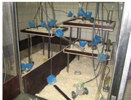
Fig. 3. SNE cage design

To get reasonable data the antennas are placed on strategically chosen spots, i.e. where the mice must cross. Every Plexiglas tube has two antennas at the end and the beginning (Figure 2), so it can be detected when a mouse changes the floor, in which direction mice cross the tubes and also the speed of mice. In every area there is an antenna beneath the drinking bottle to get data about the drinking behaviour and to establish a warning system when a mouse does not drink. Additionally, every area contains a tube supplied with two antennas which enables to collect data about the movement on the floors and eventual dominance relationships. In total there are 27 antennas integrated in the SNE (Figure 3). With this design it is possible to collect the necessary data about movement and behaviour.