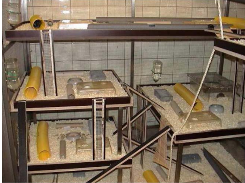
Fig. 1. Semi Natural Environment

Previously, data has been collected manually by observers sitting in front of this complex cage. The observers are thoroughly trained in behavioural biology and can differentiate up to 55 unique behavioural and movement patterns. The population is allowed to grow up to a size of 40 adult mice (plus their offspring), who are individually marked using a colour code scheme on their tails and ears. The resulting data gets analysed statistically to compare mice with different genotypes.