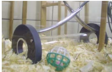
Fig. 2. Tube with antenna

The cage is restructured to get information about the mice on changing floors, movement on the floors, the direction of movement, the home range of individuals, drinking and emigration behaviour. To gather those data the cage is realised as follows: The SNE is divided into five areas. The ground is divided by a wall into two sections and there are 3 floors on different levels which are connected by sloping tubes and a rope. Outside the SNE an emigration cage is provided that can be accessed from the ground floor (i.e. to give shelter to low-ranking animals within the group hierarchy) via a tube and crossing a water basin.