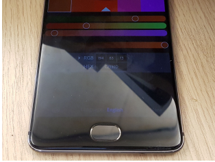
Figure 2: A smartphone in a brightly lit room, with half the device in shade. The low contrast menu text at the bottom of the screen becomes difficult to read.